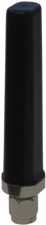
Model Shown: SA-4400-5900