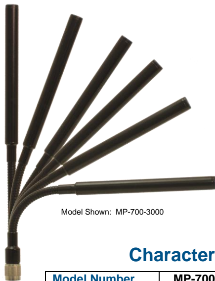
Model Shown: MP-700-3000