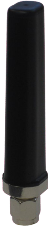
Model Shown: SA-420--575