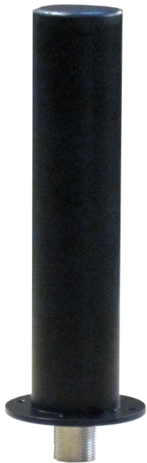
Model Shown: VM-700-2600