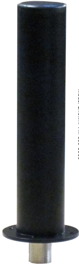
Model Shown: VM-800-3000