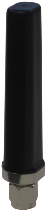
Model Shown: SA-1700-1900